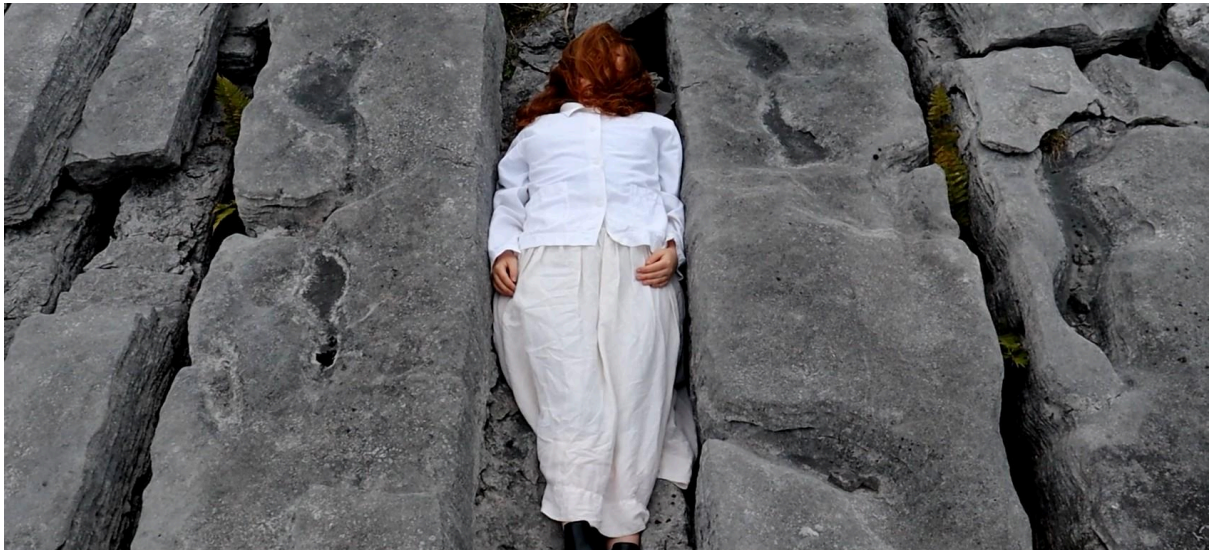
Theo Hynan Ratcliffe, 'Sleeping in the stones', video, plaster, handmade paper from dust, hair, artist's garden apples and scrap paper, 2025

Hynan-Ratcliffe to create clay objects and share stories. In Make Me by Diva Collective, the work is shaped in real time through the presence and actions of the audience, making each performance unique.